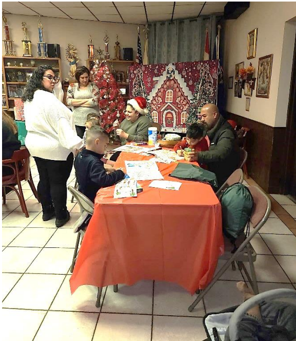
Maltese American Benevolent Society, Inc. Detroit