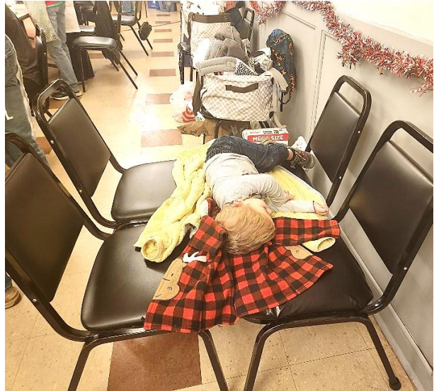
Some just had to take a break from it all