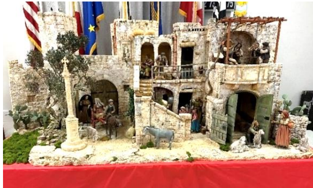
The presepju fully set up in place

The cognizance, understanding, and acceptance of the Maltese heritage on the West Coast of the United States is of utmost importance to the Maltese Americans in the Bay Area and this presepju will greatly enhance this effort.